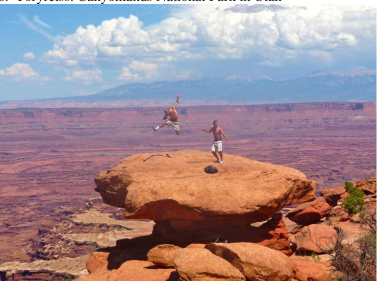
Elevated by nature – in Canyonlands National Park, Utah