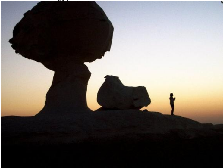
Taken during a desert safari in Egypt