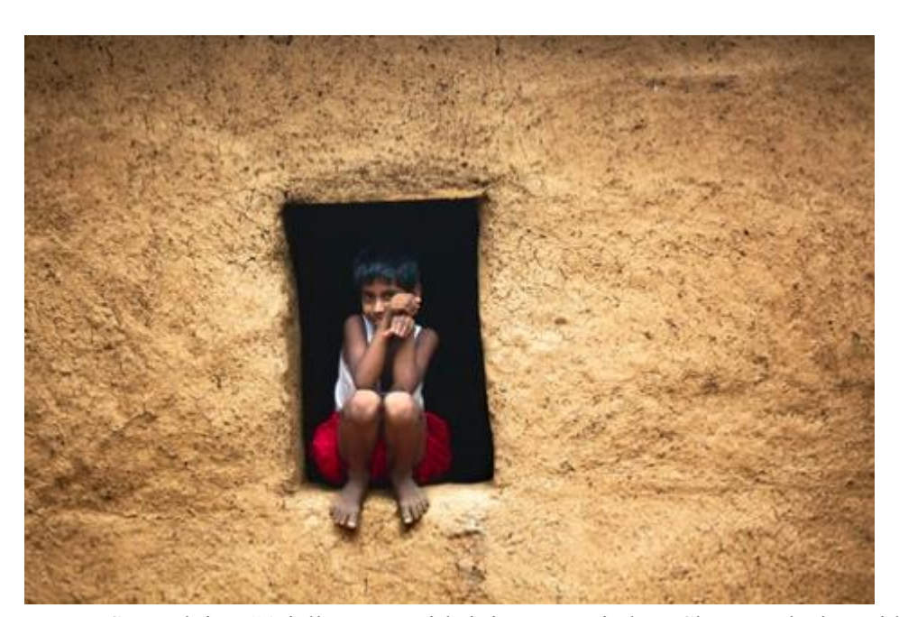
Says Ishtiaq, "A jolly young girl sitting on a window. She was playing with her friends on a muddy road with rocks. She ran across the road and sat on the window as I passed by with my camera. The shy, happy glare in her eyes are still unforgettable."