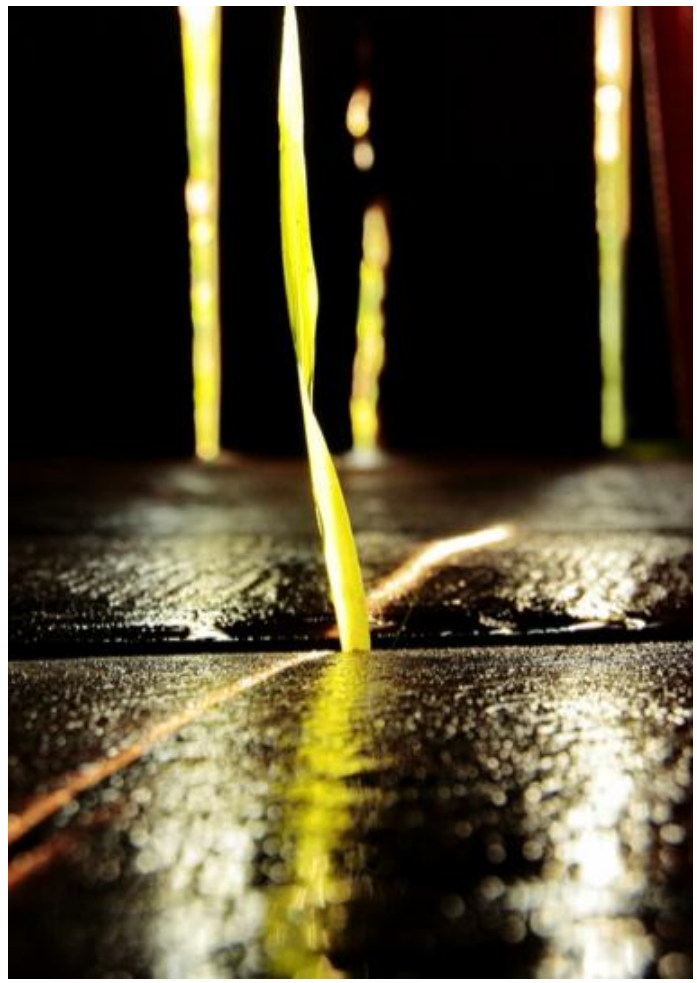
Says the photographer, "In the midst of my bucket shower, a single ray of light was illuminating this blade of grass growing up through the floor of our bungalows' bathroom." Location: Koh Rong Samloem, Cambodia