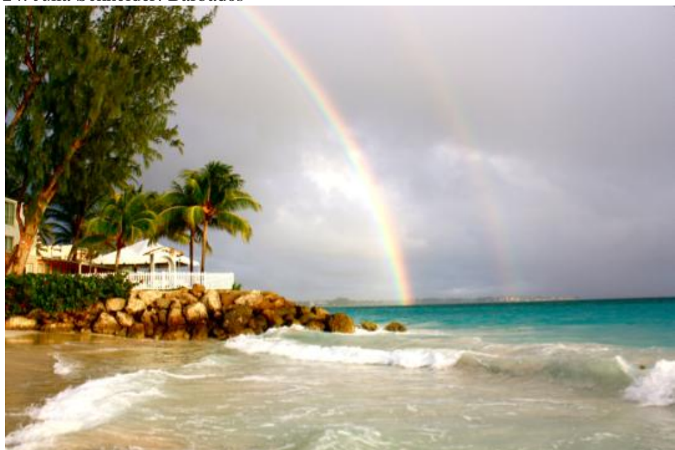
Barbados 2011, Double Rainbow