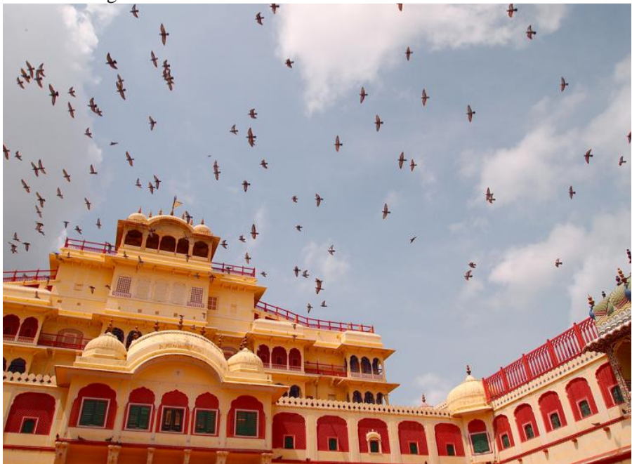
Birds putting on a show at City Palace in Jaipur, India