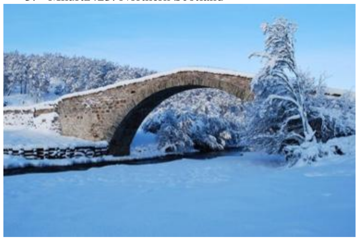
Frozen Creek in Northern Scotland