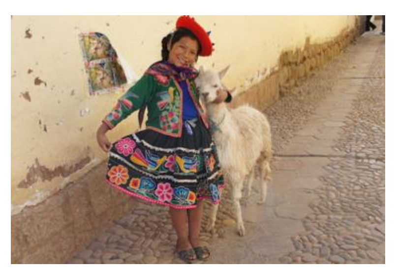
Cusco, Peru, June, 2011. She was posing for money. But it's still one of my favorite photos among the many, many I took.