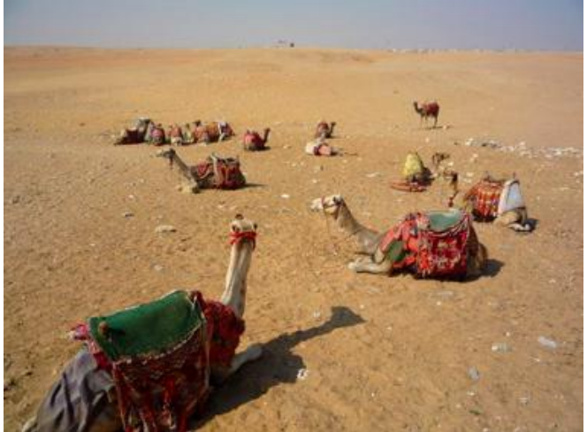
Camels relaxing between rides in Cairo, Egypt.