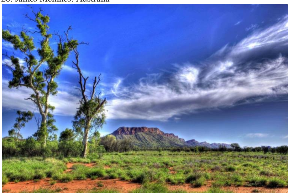
Red Centre Dreaming...Central Australia

21. LandLopers: Lake Louise, Alberta Canada