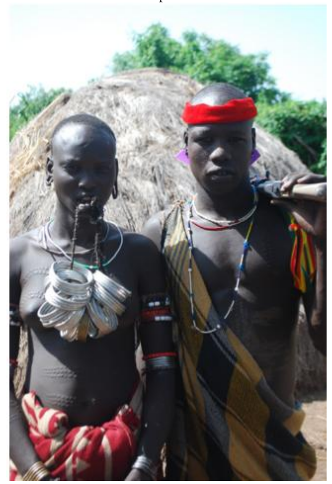
Mursi Tribe in Ethiopia.