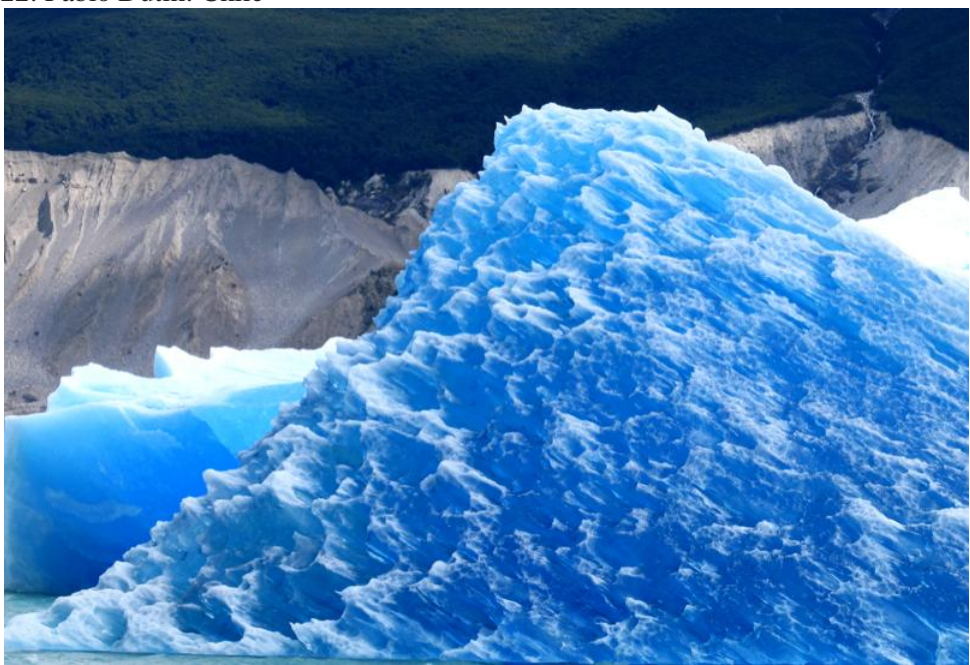
Global warming in O`Higgins Lake, Chilean Patagonia.