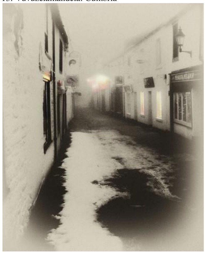
This image was taken on a cold and foggy morning in Penrith, Cumbria.