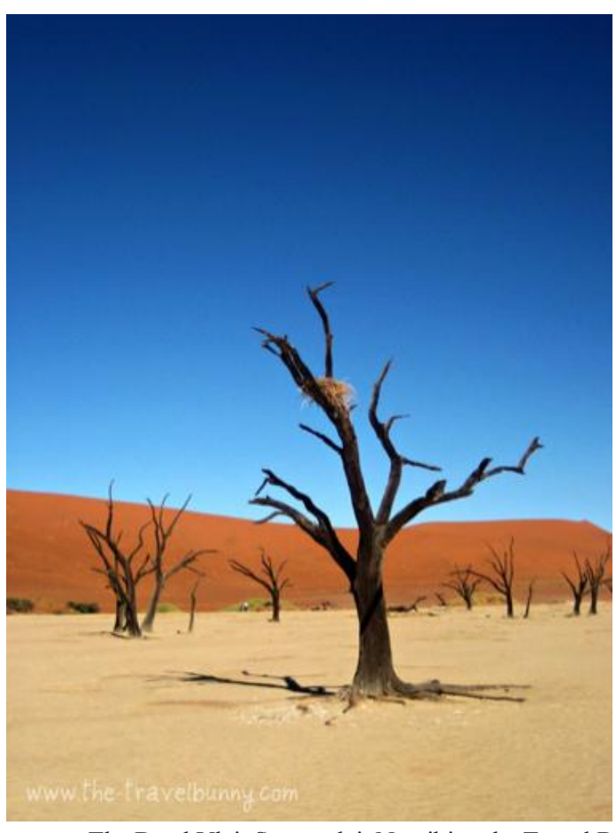
The Dead Vlei, Sossusvlei, Namibia, the Travel Bunny says, "I was amazed to see that a bird had built a nest amid all the sand, dust and heat of the desert."