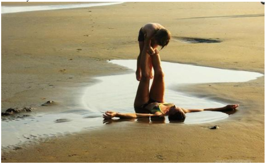
"A MOTHER & HER MOST PRECIOUS GIFT" – This photo was taken at Vagator Beach, Goa, India.