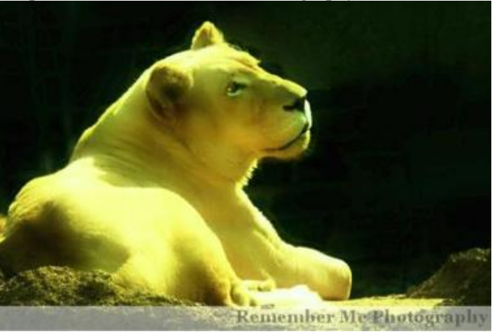
Says April: "This photo was taken in a zoo, the lion just looked so beautiful just sitting there," she says, "I had to photograph it, they are absolutely the most amazing animals."